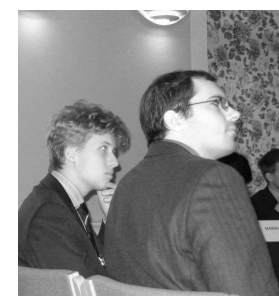
Experts looking forward for the MICC 2006 ...