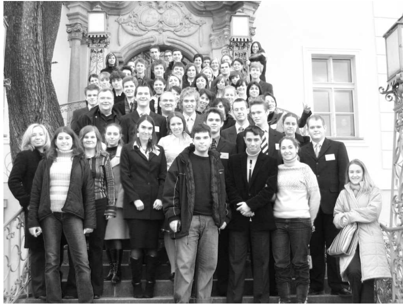
First MICC was called a "great success" in the evaluation conference on Saturday evening.